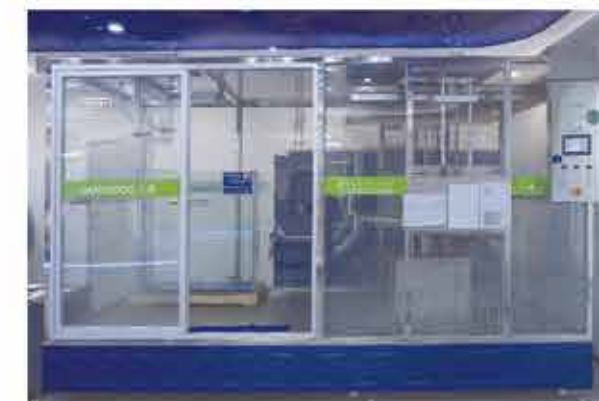
UV Accelerated Weathering Testing