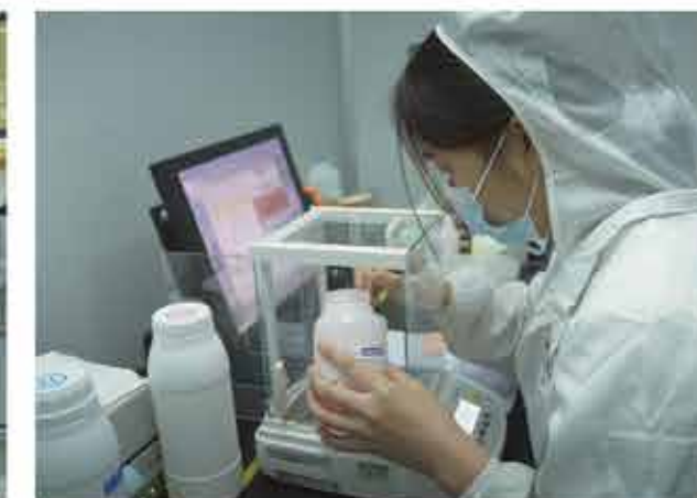
Configure The Fluorescent Glue