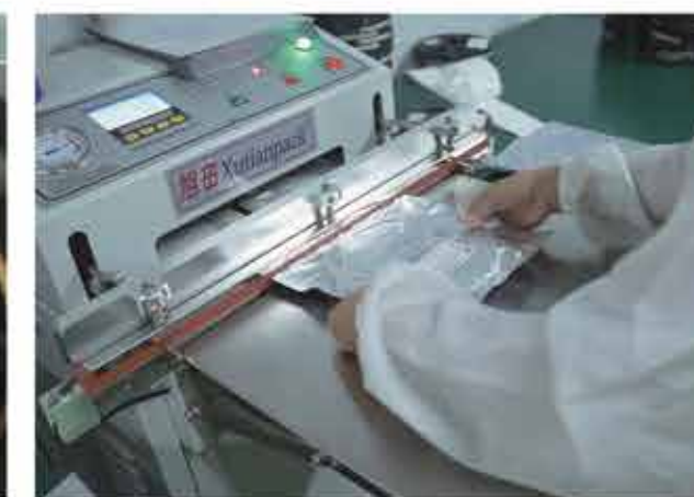
Vacuum Packaging Machine