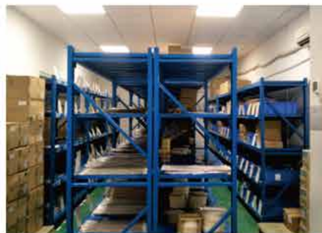
Raw material storage

Test CCT, CRI, lumens etc. Conduct incoming materials quality control with reliable equipment and function. Conduct reliability tests and function. Prepare IQC Reports.