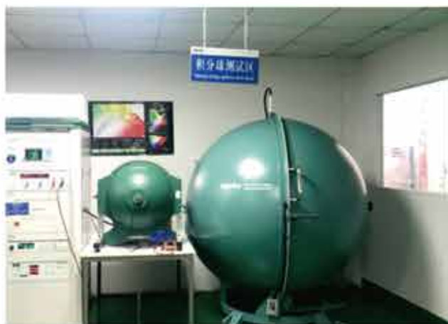
1.5m \phi 0.5m Integrating Sphere Test

Selecting the match color with reliable equipment. Check again with eyes.