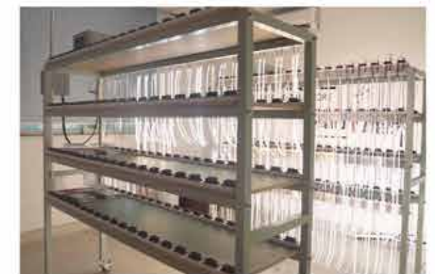
Lumen Flux Maintenance Test