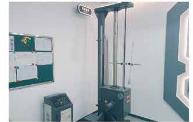
Drop test Area