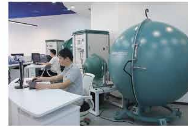
1.5m and 0.5m Diameter Integrating Sphere