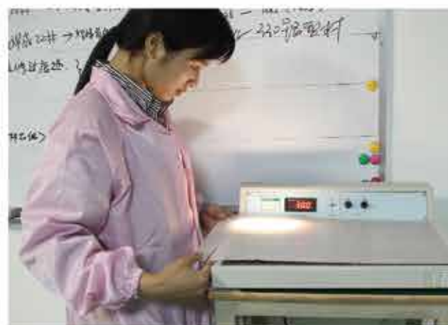
Match the color

OK, write qualification test report and approved sample. NG, materials will return to supplier with NG report.