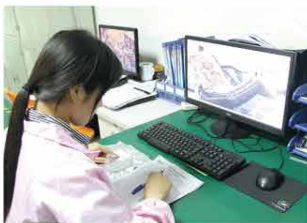
Incoming Materials checking

For all the LED strip which is strictly according to IEC Standard and IPC-A-610E standard.