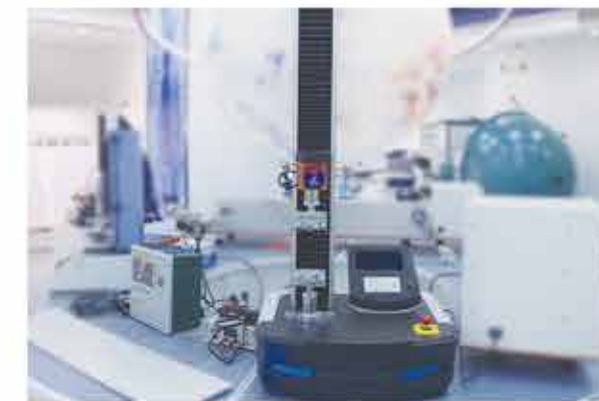
Tensile testing machine