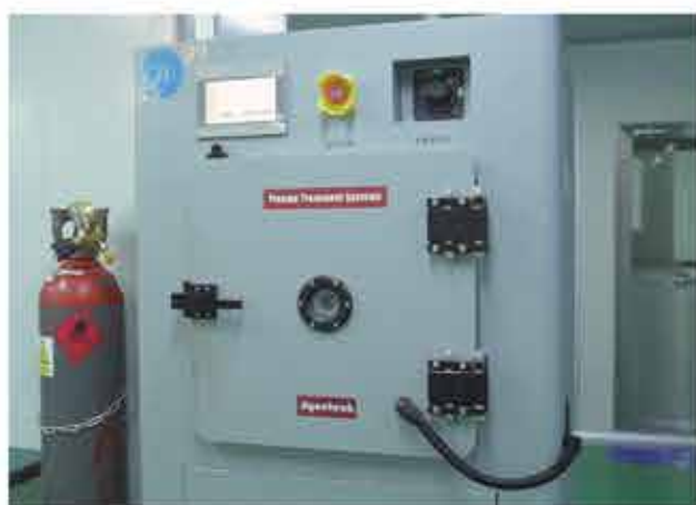
Plasma Treatment Systems