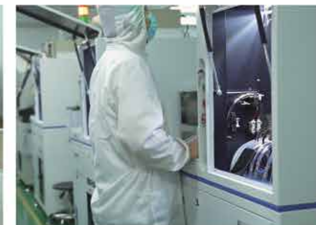
SMD-LED Automatic Spectrophotometer