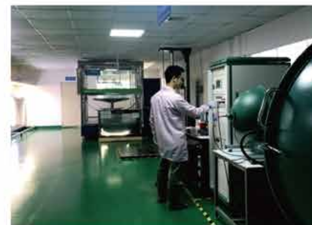
Incoming Materials checking

Ensure the consistency and accuracy of SMT. Conduct first product inspections in different stage of production. Inspect the process of production.