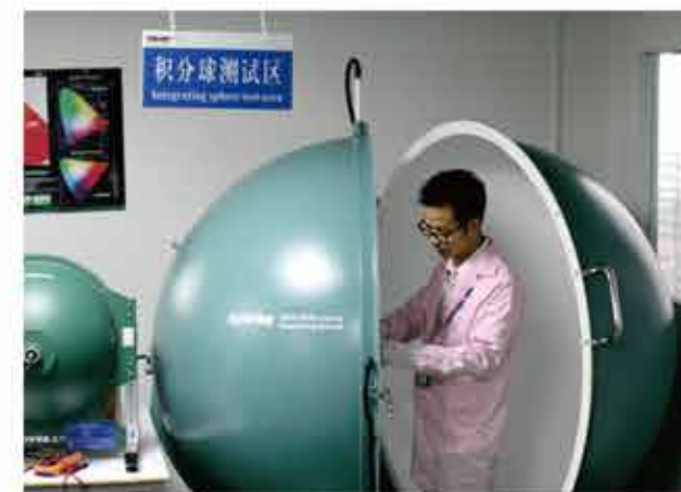
First sample test

Temperature And Humidity Warehouse Protect the quality of product to constant.